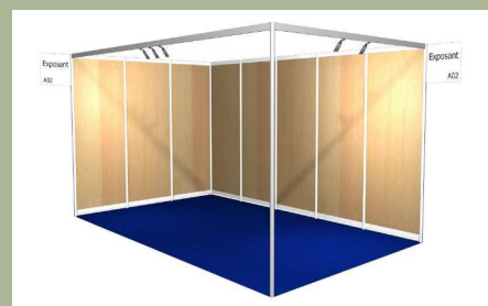
THE BASIC STAND