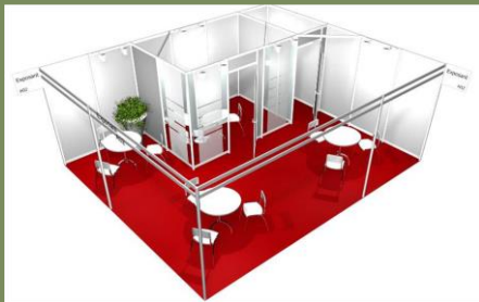
THE TURNKEY STAND

CHOOSES THE BEST STAND OPTION TO MEET YOUR NEEDS!